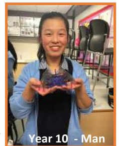
Year 10 - Man

"Jewellery club is really fun. I usually don't do stuff like this but now I might reconsider."